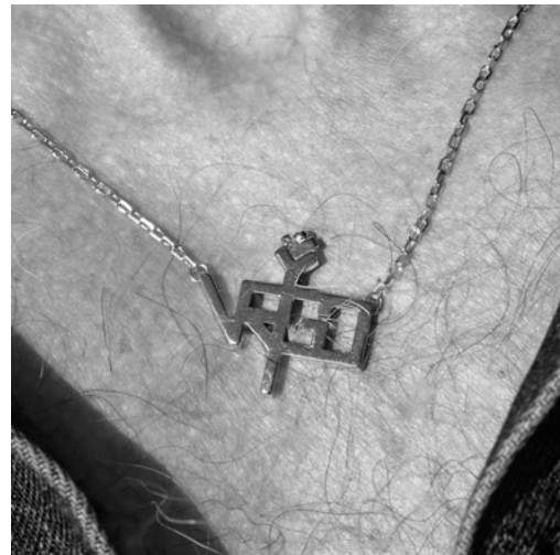
Virgo August 23rd - September 22nd