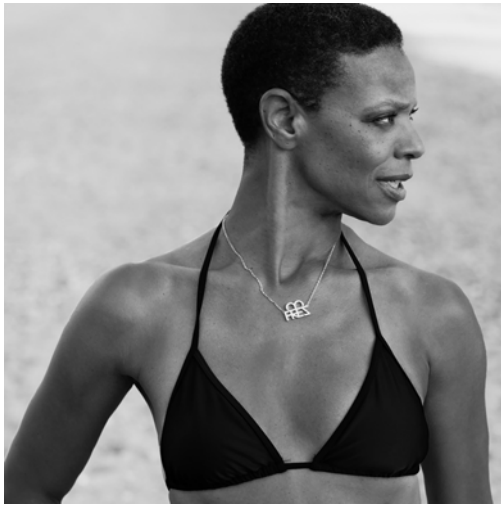
Aries March 21st - April 20th