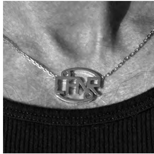
Cancer June 22nd - July 22nd