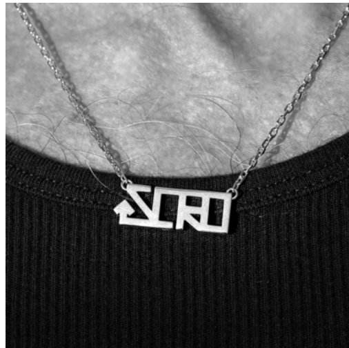
Scorpio October 23rd - November 21st