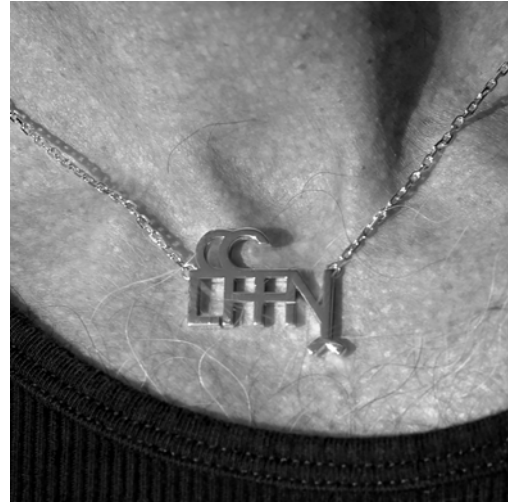
Capricorn December 22nd - January 20th