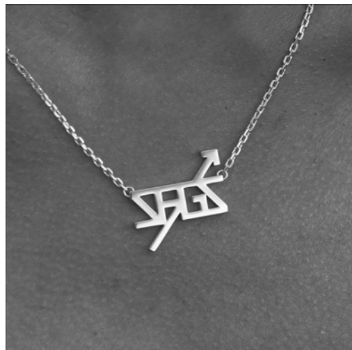
Sagittarius November 22nd - December 21st