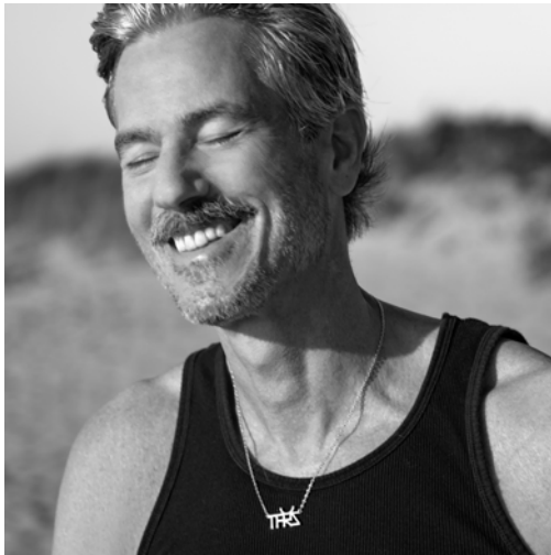
Taurus April 21st - May 21st