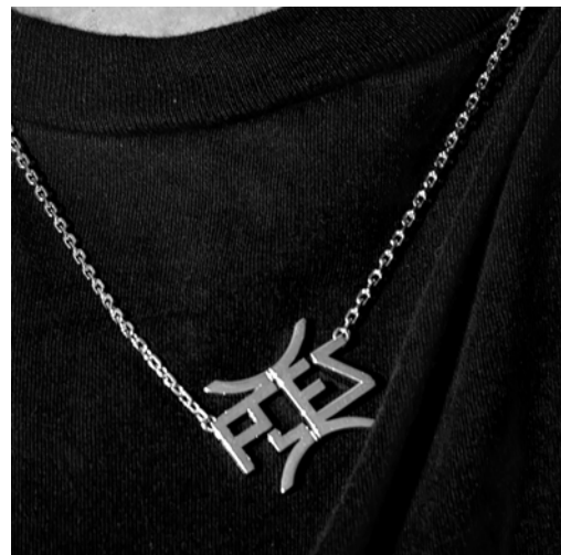
Pisces February 20th - March 20th