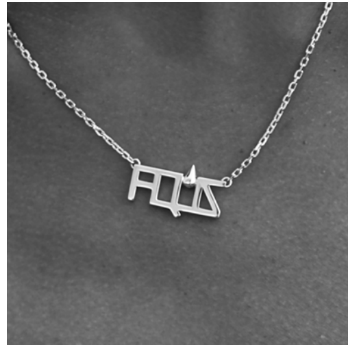
Aquarius January 21st - February 19th