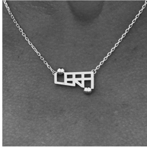
Libra September 23rd - October 22nd