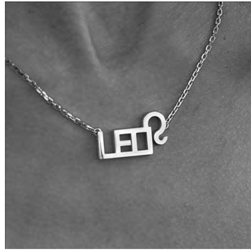
Leo July 23rd - August 22nd